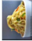
Chicken & Veg Noodles